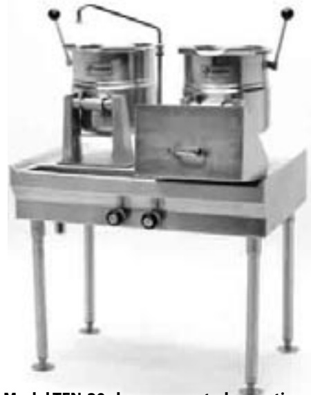
Model TFN-20 shown mounted on optional LSC table with single fill faucet with riser