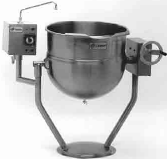
Model TWP-40 with optional automatic water filling meter