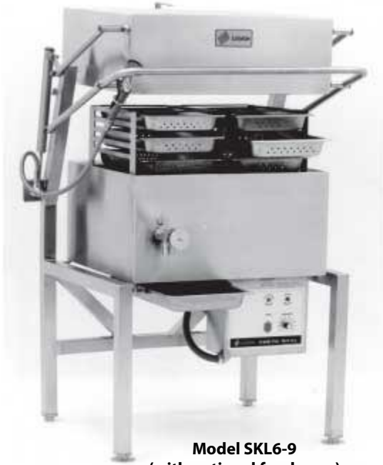
Model SKL6-9 (with optional food pans)