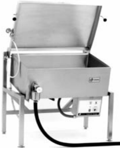
Model CS41-9 (with optional drain hose and spray hose assembly)