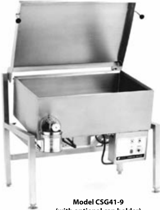
Model CSG41-9 (with optional can holder)